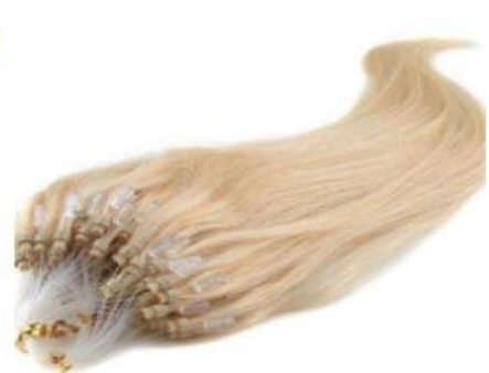
Micro ring loop hair