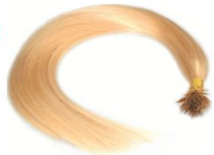
Nano ring hair