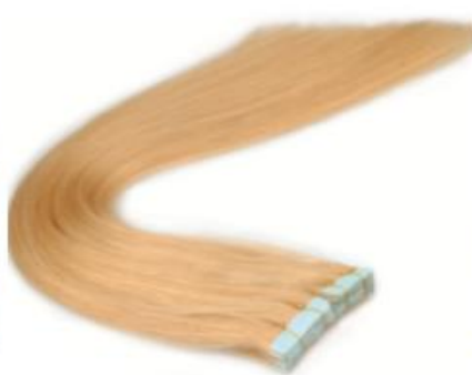
Tape in hair extension