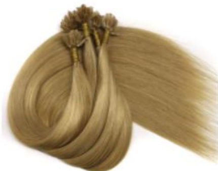
U-Tip hair extensions